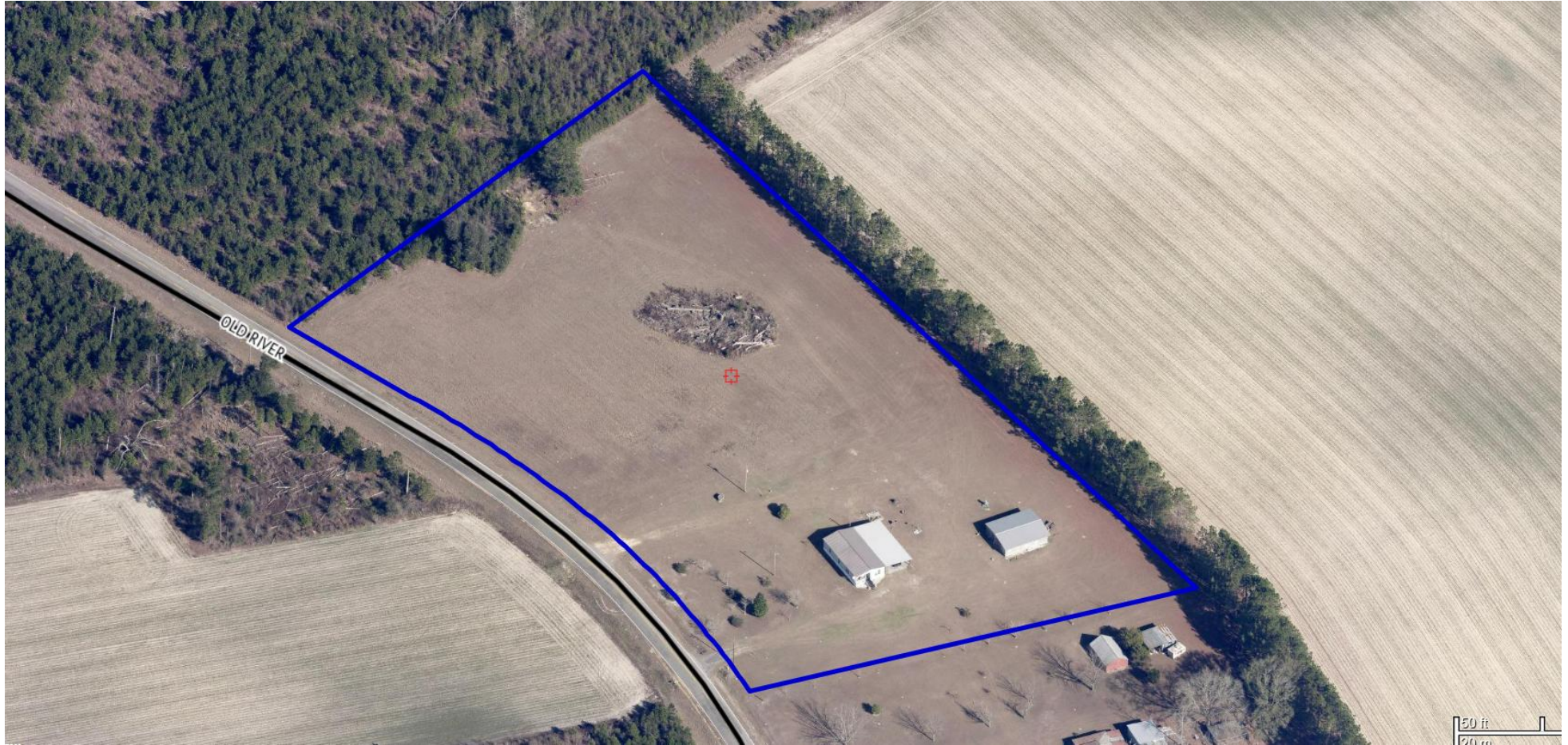
Aerial of Parcel